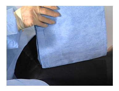
4. Next, remove the adhesive strip liner and position the drape on the patient's lower abdomen.