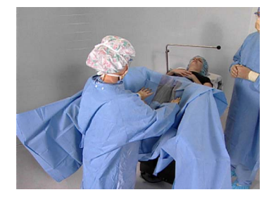
5. Unfold the drape laterally and then downward, between the patient's legs, exposing the perineal fenestration and specimen collection screen.