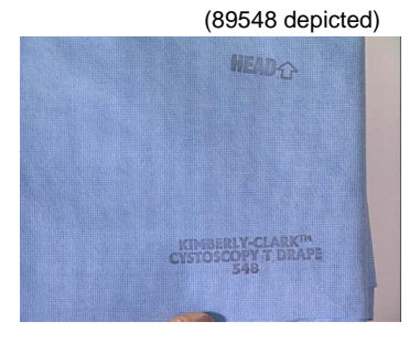
3. Orient the "Head" Stamp on the drape with the patient.