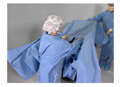
6. Continue to unfold the drape toward the patient's head. Adjust the perineal fenestration and specimen collection screen.