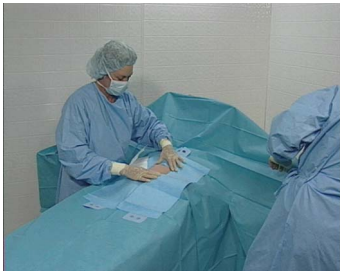
4. Unfold drape toward head firmly seal sides of fenestration to patient's skin. Insert surgical lines and tubing through tube holders.