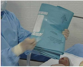
1. Orient body stamp on drape with patient and remove adhesive strip liners clockwise.