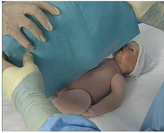
2. Center drape over operative site.