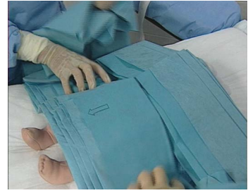
3. Unfold drape, first laterally, then toward feet.