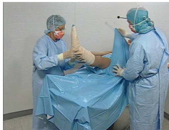
5. Conform first one side of split around leg, then the other.