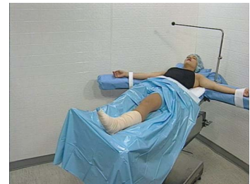
6. Draping is complete in preparation for a key drape.