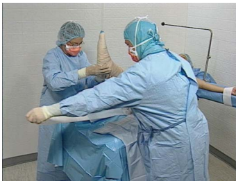
4. Unfold tails and remove adhesive strip liners.