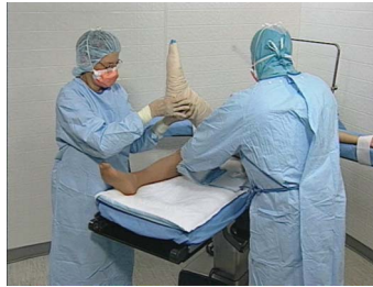
2. Center drape below extremity or area to be draped.