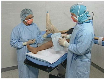
1. Locate the "Tails" and arrow markings on the drape and orient with the patient.