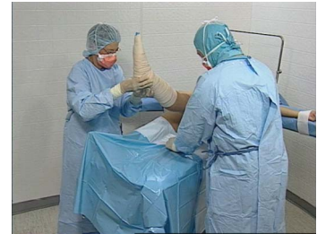
3. Unfold drape, first laterally, then toward feet to expose adhesive strip liners.