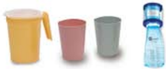
Patient Bedside Products