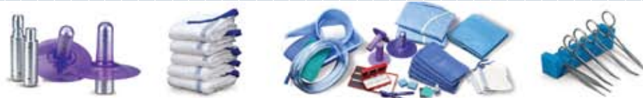
Operating Room Products