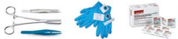
Kits & Trays