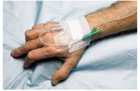
Medipore™ +Pad on IV catheter site