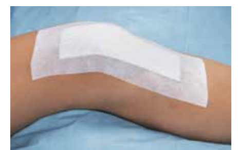
Medipore™ +Pad on knee