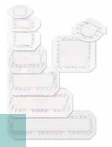
Tegaderm<sup>™</sup> +Pad Full range of sizes to fit every application need.