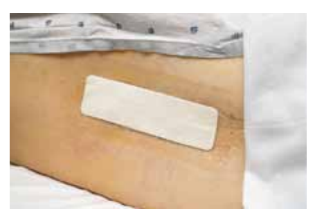
Tegaderm™ +Pad on epidural

*In vitro testing shows that the transparent film of Tegaderm™, Tegaderm HP™ and Tegaderm™ CHG dressings provides a viral barrier from viruses 27 nm in diameter or larger while the dressing remains intact without leakage.