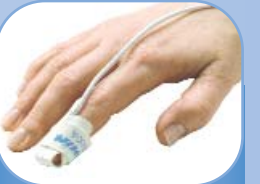
7000A Adult Flexi-Form II (> 30 kg / > 66 lb)

*Optional Reusable Sensor Extension Cables are available in 1m, 3m, 6m and 9m lengths.