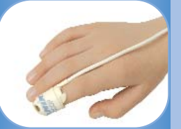
7000P Pediatric Flexi-Form II (10 - 40 kg / 22 - 88 lbs)