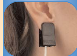
8000Q Ear Clip (> 40 kg / > 88 lbs)