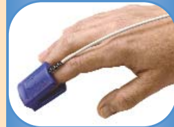
8000AA Adult Finger Clip (> 30 kg / > 66 lbs)