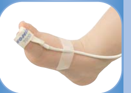
7000I Infant Flexi-Form II (2 - 20 kg / 4 - 44 lbs)