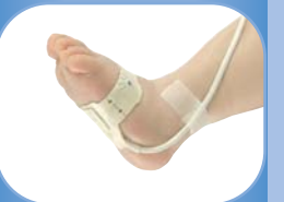
7000N Neonatal Flexi-Form II (< 2 kg / < 4 lbs)