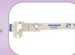
8001JFW Neonate FlexiWrap