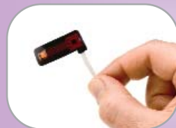
8008J Infant Flex Sensor