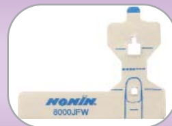
8000JFW Adult FlexiWrap