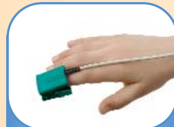
8000AP Pediatric Finger Clip (10 - 40 kg / 22 - 88 lbs)

Nonin has designed an array of PureLight reusable sensors – available for patients of all sizes (adult, pediatric, & infant) and clinical presentations. The 8000 Series of reusable sensors are ideal for short-term monitoring, stress testing and spot checks – any situation where the risk of cross-contamination is low. A comfortable sensor, each is designed for a specific application and is form-fitted to decrease ambient light interference.