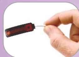
8000J Adult Flex Sensor