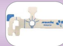
8008JFW Infant FlexiWrap