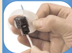
Reflectance Sensor Holder (10 pack w/ 20 adhesive collars)