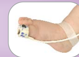
Infant Flex System (2 - 20 kg / 4 - 44 lbs)