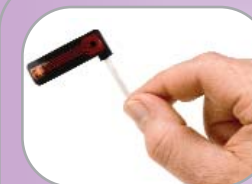
8001J Neonate Flex Sensor