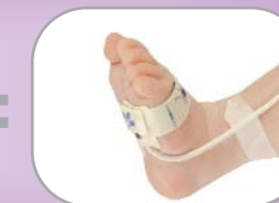
Neonate Flex System (< 2 kg / < 4 lbs)