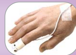
Adult Flex System (> 20 kg / > 44 lbs)