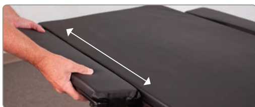
Removable lateral extensions slide and lock on T-rails.