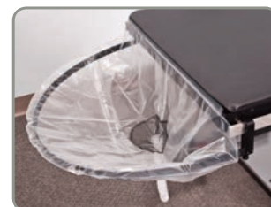
Table comes with hoop and clamps to t-rails. (bags not included)