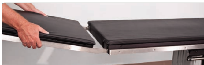
Lightweight design can be used for general imaging when a full length diving board table design is required.