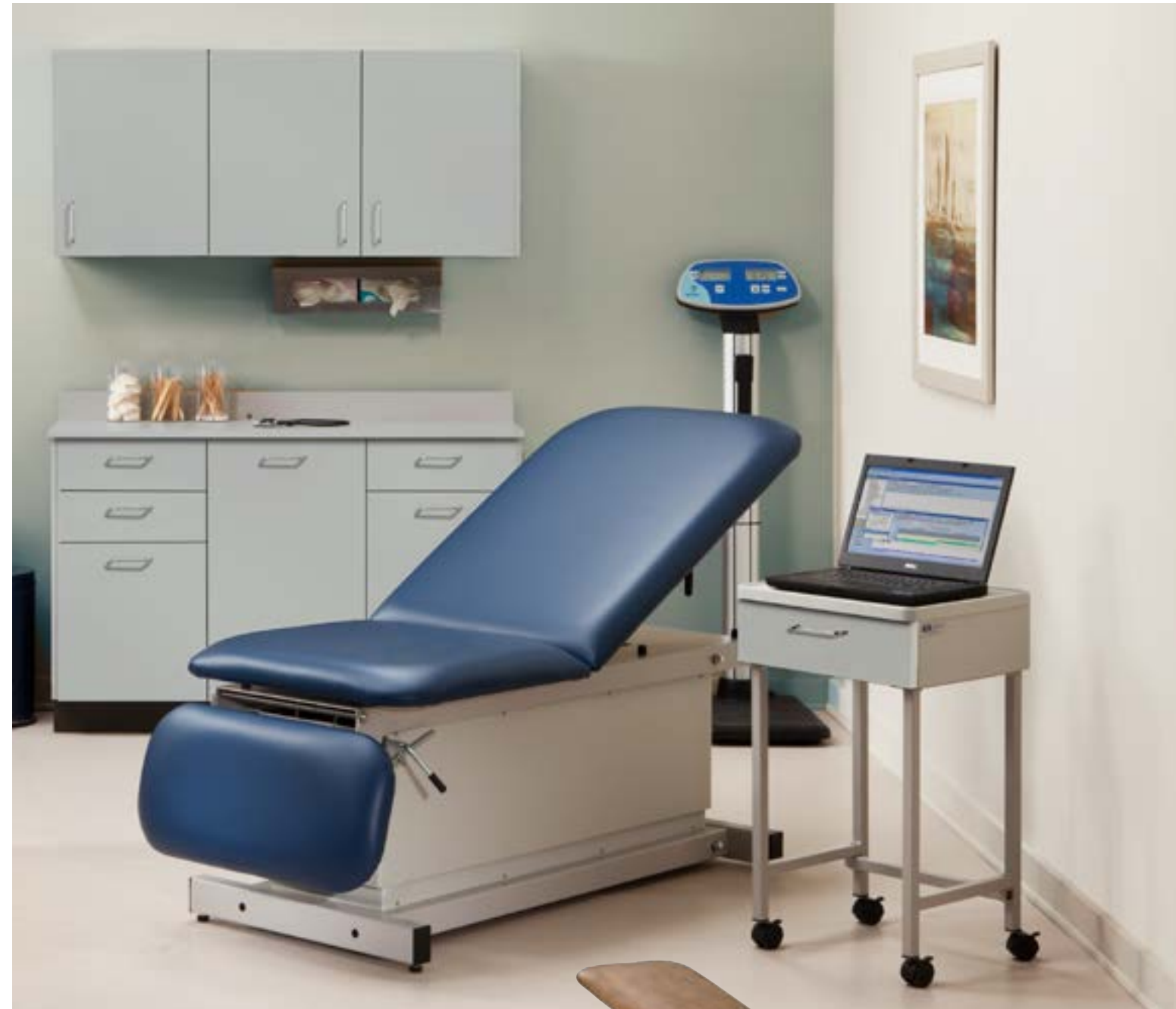
Shown with optional, solid drop section

For more information go to www.P6SWarnings.ca.gov .