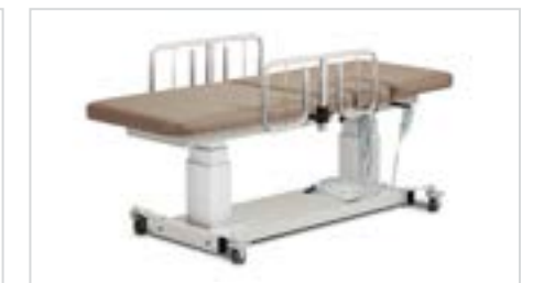
Optional Side Rails & Casters