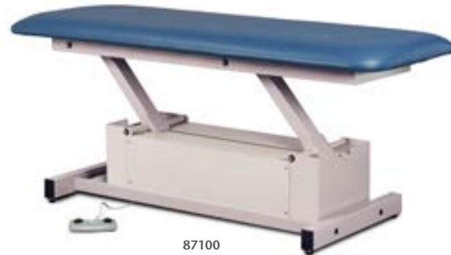
Power-Glide, Hi-Lo, Treatment Table with One Piece Top