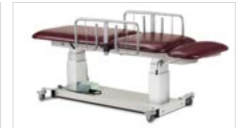
Optional Side Rails & Casters