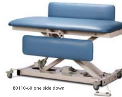
80110-60 one side down

For more information go to www.P65Warnings.ca.gov .