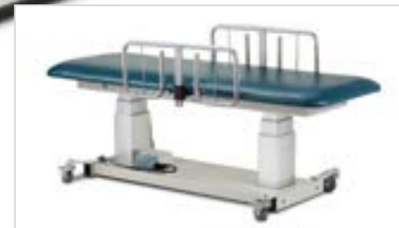
Optional Side Rails & Casters

! WARNING: This product can expose you to chemicals, including chromium, which is known to the State of California to cause cancer or reproductive toxicity.