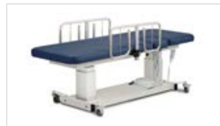
Optional Side Rails & Casters

⚠ WARNING: This product can expose you to chemicals, including chromium, which is known to the State of California to cause cancer or reproductive toxicity.