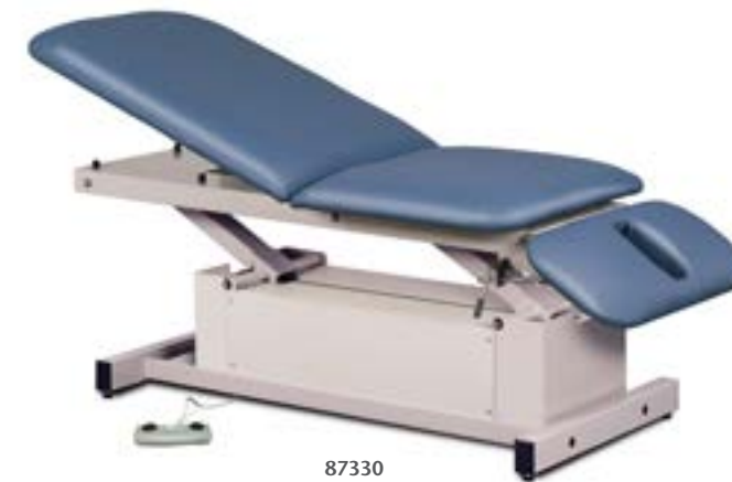
Power-Glide, Hi-Lo, Treatment Table with Adjustable Backrest & Drop Section