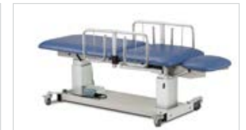
Optional Side Rails & Casters