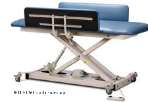
80110-60 both sides up