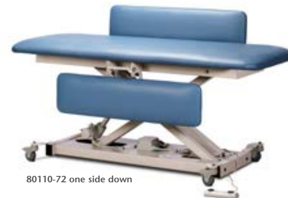
80110-72 one side down