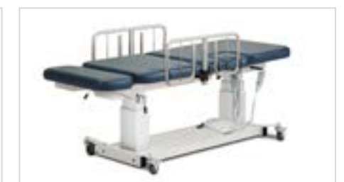
Optional Side Rails & Casters