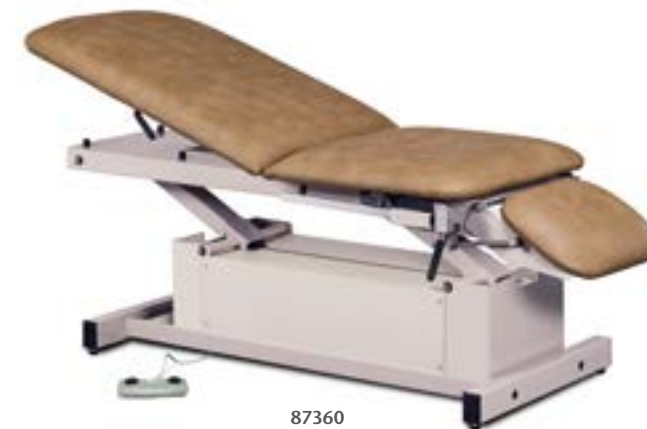
Power-Glide, Hi-Lo, Treatment Table with Adjustable Backrest, Footrest and Stirrups