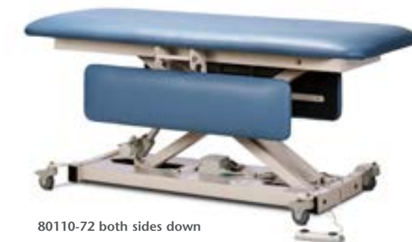
80110-72 both sides down