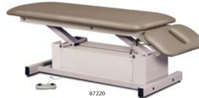
Power-Glide, Hi-Lo, Treatment Table with Flat Top and Drop Section