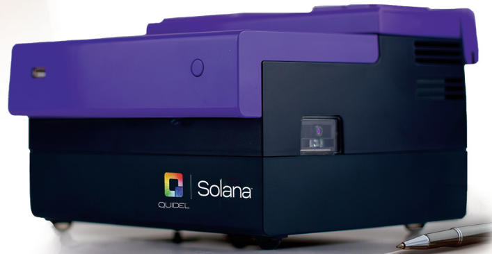
Solana Strep Complete Assay run with the Solana bench top instrument a mere 9.4" x 9.4" x 5.9"

The Accurate. Sustainable. Molecular Strep Solution.