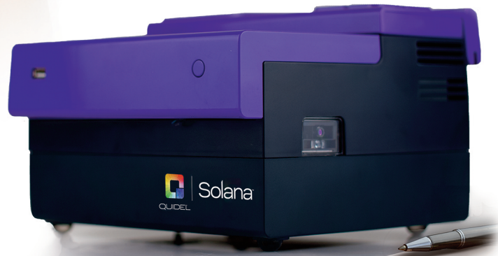
Solana Strep Complete Assay run with the Solana bench top instrument a mere 9.4" x 9.4" x 5.9"

The Accurate. Sustainable. Molecular Strep Solution.