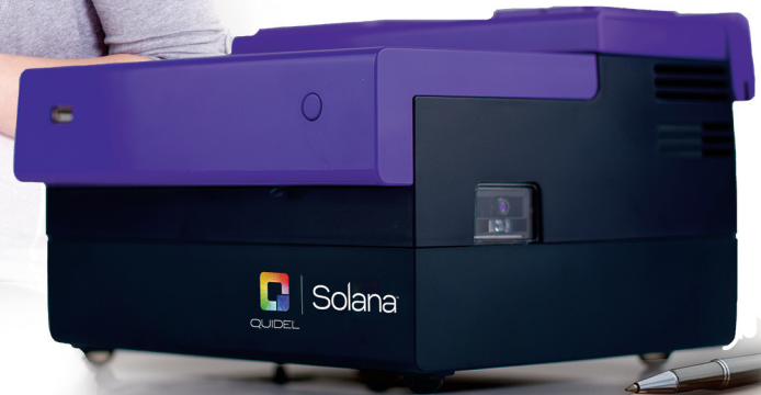
Solana GBS Assay run with the Solana bench top instrument a mere 9.4" x 9.4" x 5.9"

The Accurate. Sustainable. Molecular GBS Solution.