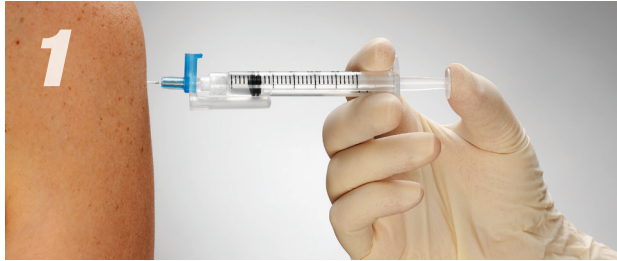
1 Attach EasyPoint needle to any luer lock or luer slip syringe. Administer medication according to institutional policy.