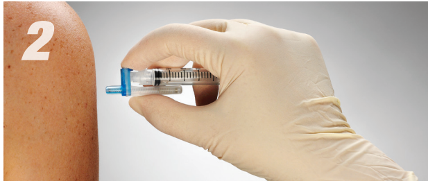
2 Apply pressure to the color-coded tab and the safety chamber using a squeezing motion, allowing the needle to automatically retract into the safety chamber. This device is designed for activation before or after removing the needle from the patient.