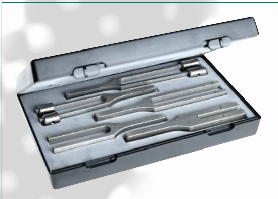
No. 5141 Set II 5 tuning forks made of steel (No. 5161, No. 5164, No. 5166, No. 5168, No. 5170) in plastic case