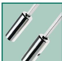
First class finish and exact adjustment of the clamps produce notes which do not vary.