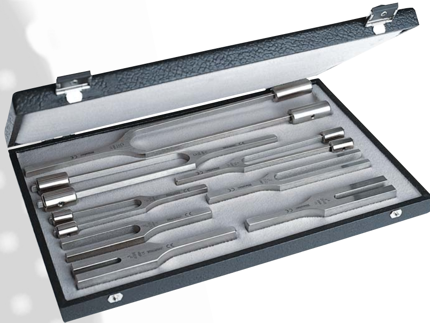
No. 5140 Set I 8 tuning forks made of steel (No. 5163, No. 5160, No. 5161, No. 5164, No. 5166, No. 5168, No. 5170, No. 5172) in wooden case

The tuning fork sets are well thought-out combinations in an attractive practical wooden or plastic case to perform full hearing tests. The most important frequencies are all conveniently to hand.