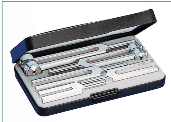
No. 5142 Set III 5 tuning forks made of aluminium (No. 5162, No. 5165, No. 5167, No. 5169, No. 5171) in plastic case

Rudolf Riester GmbH P.O. Box 35 • DE-72417 Jungingen Germany Tel.: +49 (0)74 77/92 70-0 Fax: +49 (0)74 77/92 70-70 info@riester.de www.riester.de