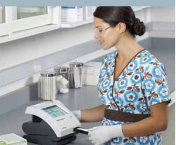
Automated hCG pregnancy testing