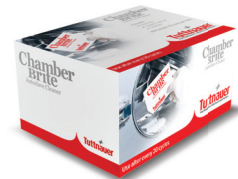
Chamber Brite Autoclave Cleaner