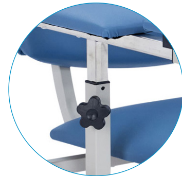
ARMREST HEIGHT ADJUSTMENT: 27.8" - 38.5"