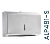
C-Fold / Multi-Fold