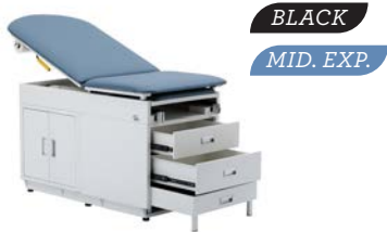
Grande Steel Exam Table