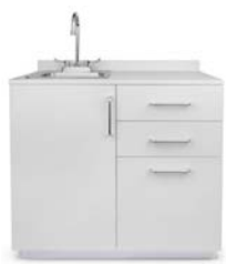
36-Inch Base Cabinet