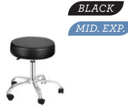
Luxe Exam Stool