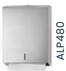
C-Fold / Multi-Fold