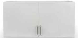
48-Inch Wall Cabinet