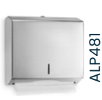
C-Fold / Multi-Fold