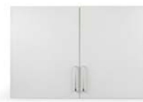
36-Inch Wall Cabinet