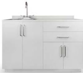
48-Inch Base Cabinet