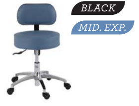
Pneumatic Height Adjustable Exam Stool