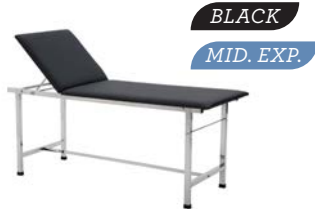
Noble-Line Exam Table