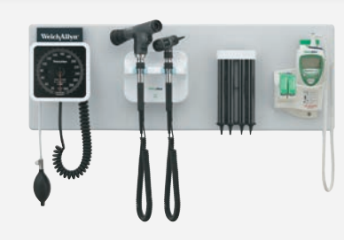
Integrated Wall System