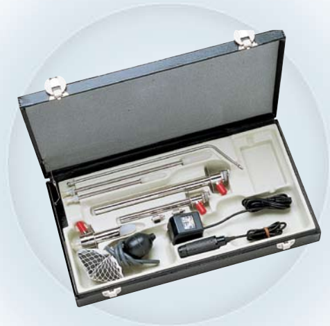
35303 Fiber Optic Sigmoidoscope Set