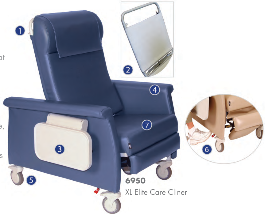
6950 XL Elite Care Cliner