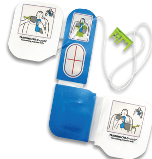
CPR-D-padz Trainer Electrodes Part# 8900-0804-01