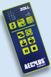
AED Plus Trainer2 Replacement Remote Part# 8008-0007