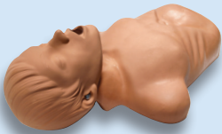
AED Plus Trainer Demo Manikin Part# 8000-0835-01