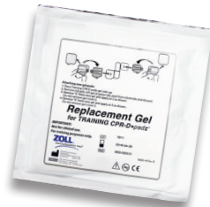
Replacement Adhesive Gels for CPR-D-padz Trainer Electrodes Part# 8900-0803-01

(Replacements must be ordered separately)