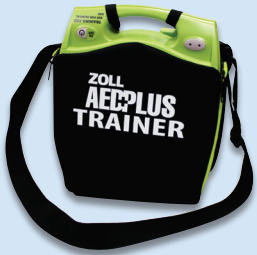
AED Plus Trainer Carry Case Part# 8000-0375-01