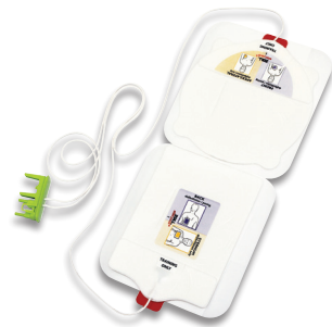
Stat-padz® II Trainer Electrodes Part# 8900-0805-01 (case of 6)