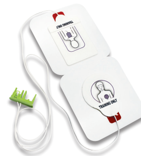
Pedi-padz® II Trainer Electrodes Part# 8900-000861-01 (case of 6)